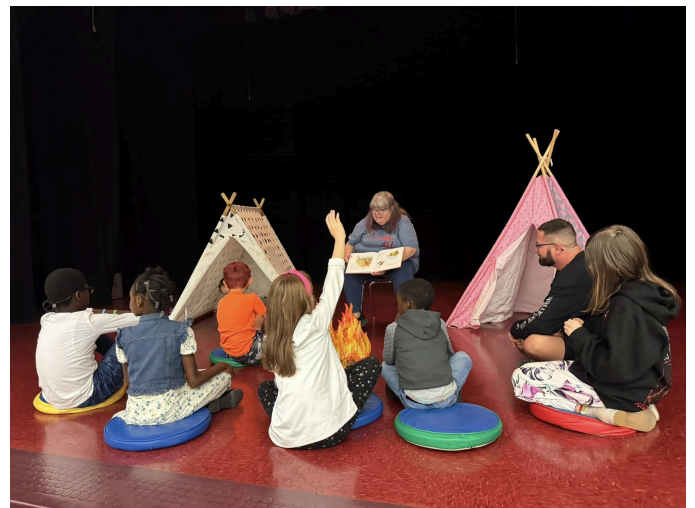
Shadowlawn Elementary students read together at the Family Literacy Night

students and their families attended Foundation literacy events